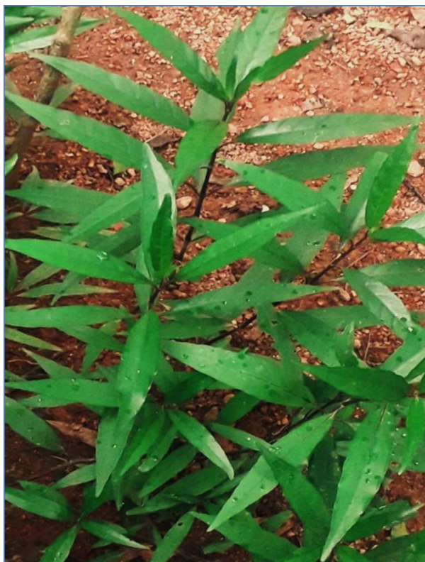
Figure 2. Justicia gendarussa Burm.f

plant as febrifuge and emetic respectively. An infusion of leaves is used orally for facial paralysis, hemiplegia, and cephalalgia, while an oil made from the leaves is beneficial in eczema. The fresh leaf juice when dropped into the ears and nostrils, gives relief from earache and hemicrania.